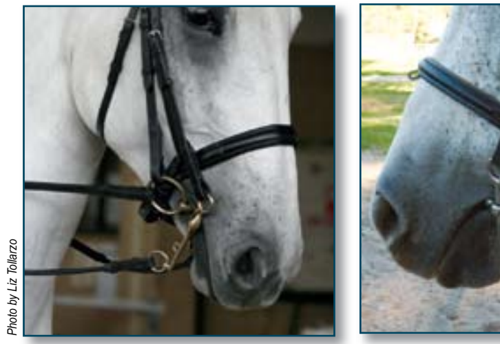
Above: Need caption for this bit please

If the horse improves in the straight bar, the rider can either keep it in this bit or try a French or lozenge style snaffle, such as a Sprenger KK or Neue Schule Tranz, as these bits are designed to interact on the tongue and avoid the palate. If, on the other hand, the horse deteriorates in the straight bar, a bit to avoid tongue pressure should be sought, though in Thoroughbreds the bars are often very finely covered so ported bits that rest largely on the bars can cause more problems and discomfort. A well fitting FM single link bit with keepers may suit in this case, or a Myler may be worth trying. Horses either love or hate Mylers there does not seem to be much in-between - but when horses like them, they are very effective and kind bits.